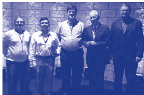
New church pastors

Pastors and representatives from each church were officially welcomed into the association during the Monday evening session and each pastor shared a testimony on Tuesday morning (video and audio of each testimony is available at www.marbc.net ). The MARBC rejoices in the opportunity to partner with these important church ministries.