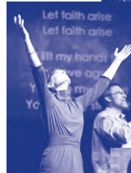
Signing for worship