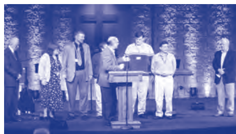
New churches welcomed

The applications of three churches seeking to associate with the MARBC were presented and unanimously approved during the Monday business session.