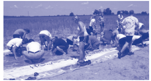
FBC Amazing Race mud pit