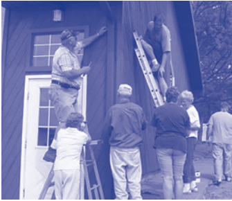
Staining the front of the building