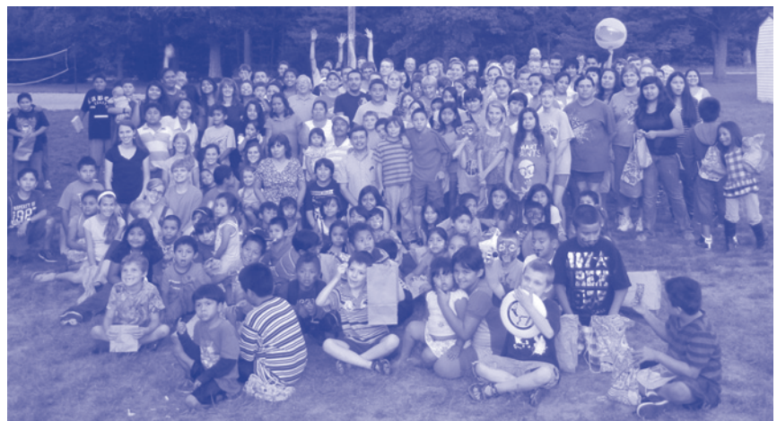
Participants of Grace Hispanic Baptist Bible Church DVBS