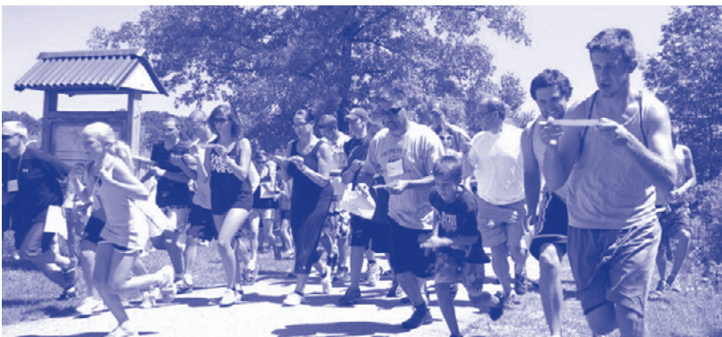
The FBC Amazing Racers race on

The FBC Amazing Race was able to raise over $3,600 through player registrations, challenge level sponsors from many local businesses, and personal donations made during and after the event. More donations have been received after the event. If you would like to make a donation please contact the Special Operations Warrior Foundation at www.specialops.org .