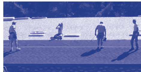
West Cannon and Bible Baptist CPR project