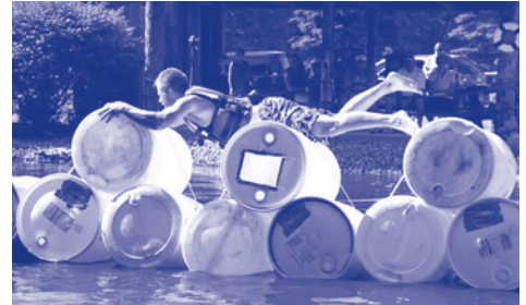
FBC Amazing Race water obstacle