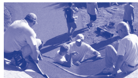
CPR roofing project in Ishpeming

The plan was to do the parsonage roof, too. But that was too much project. So, a week later the church family spent about 5 - 14 hour days reshingling the parsonage and garage roofs. There was rotted wood on the parsonage roof that needed to be replaced, and unexpected rain the first day that damaged the living room ceiling. We are so grateful for the help of the group from West Cannon and many of the Bible Baptist Church family who were able to help with the project.