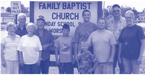
CPR ministry team from First Baptist in Vestaburg