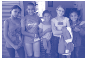
Helping at a Brazilian orphanage

God did great things in the hearts of the team and they all feel greatly blessed to have participated in this life-changing experience. Seeing what missionaries do and the sacrifices they make helps to understand the commitment behind the support of missionaries in the local church. The words taken from the Doxology say it best, "Praise God from Whom all blessings flow! Amen."