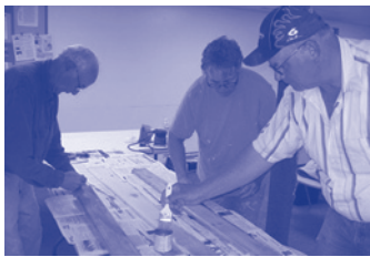
Preparing the chair railing