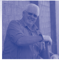
Ministering in the building project

expertise worked on preparing the church parking area for a delivery of cement.