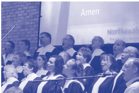
An appropriate comment on PowerPoint