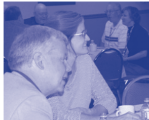
Fellowship at the dessert reception