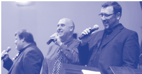
The Men's Quartet was a blessing