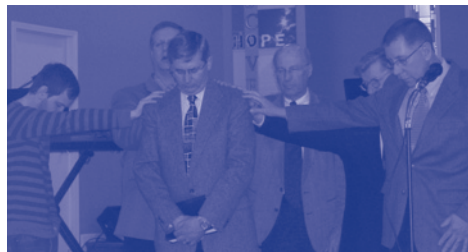
Dedicatory Prayer at Schiedel Installation Service