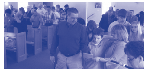
Calvary rededication service

Sister churches and ministry teams involved in the MARBC's CPR program helped assist the church in several renovation projects in recent years. The most recent work was accomplished in the summer of 2010 by a ministry group from West Cannon Baptist Church in Belmont, Michigan. Facility renovations include repainting of the auditorium and other rooms, expansion of the foyer and entry area, and upgrades in the lower level. Other exterior work was also completed