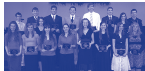
2009 Talents for Christ first and second place winners

We praise God for all of our MARBC teens who participated in this year's event and encourage you to pray for those who will compete nationally in Elyria at the end of June.