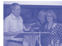
Official transfer of Newhall facilities to Alpha Women's Center