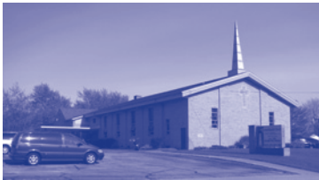
Newhall Baptist Church, 1955-2009