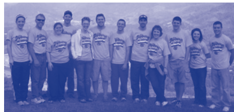
Midway Baptist Missions Team

To break up the work regiment, the team took a little time off to enjoy the scenery via a canopy tour (zip-lining through the mountains) and white-water rafting.