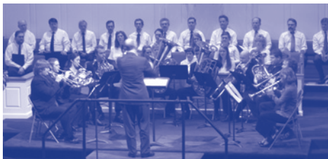
Highland Hills Concert

March of 2010. We are hoping for more quintets from area colleges to participate as well as creating a trumpet day on the Saturday of the Festival. Ultimately, we are praying for these events to give us more of a platform to share Christ with our community. It has been amazing to see God opening up doors as we progress forward in planning these events. God is at work and we are glad servants to walk where He is leading.