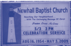
Newhall Baptist sign

We thank God for the way in which He has used Newhall during its more than half-century of ministry.