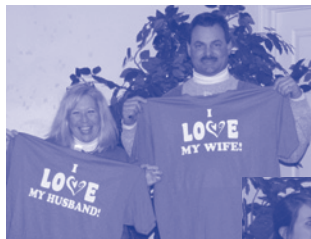
The winning couple.