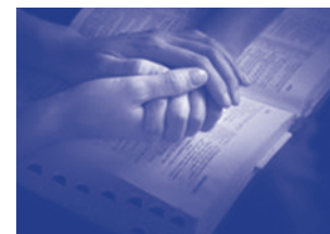
"They raised their voice to God in one accord" Acts 4:24

A day for MARBC churches to devote their attention to prayer for our churches, pastors, state fellowship, camps, ministries, missionaries, and special needs.