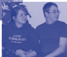
Newlyweds for 5 weeks!